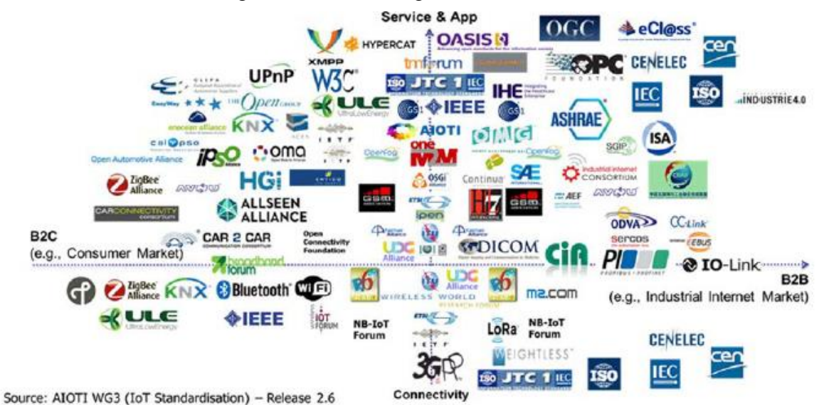
Figure 4: The IoT StandardizationLandscape (Organizations (SDOs) and Alliances) (source: AIOTI, ETSI [14, [15])

A view on the "Standardization Landscape" shows the heterogeneity of the landscape: horizontal, rather generic standards and domain specific standards, from many international and industrial standardization organizations. (see Figure 4).