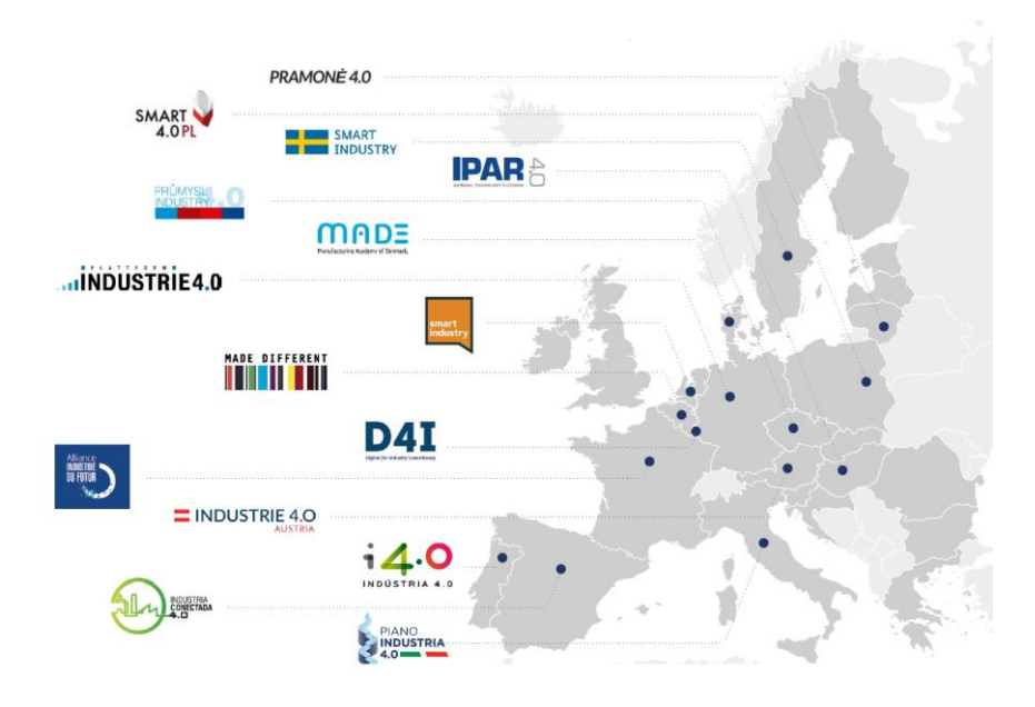
Figure 2: National initiatives for Digitizing European Industry in EU

In many European countries, many related initiatives have been started (see Figure 2)