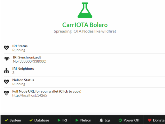
Fig. 4. Functioning Node

The answer of accessing the node is presented in Fig. 5 where the Application's Programming Interface (API's) response is given. To receive a different answer a different URL with commands should be accessed.